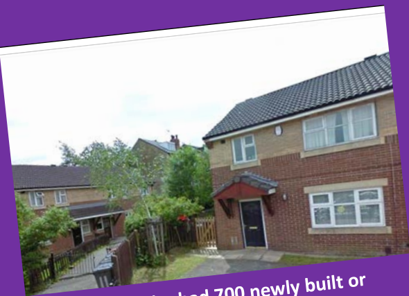
By 1997 Unity had 700 newly built or refurbished homes