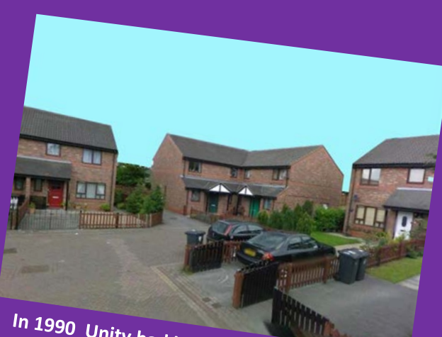
In 1990 Unity had its first development and managed 68 homes