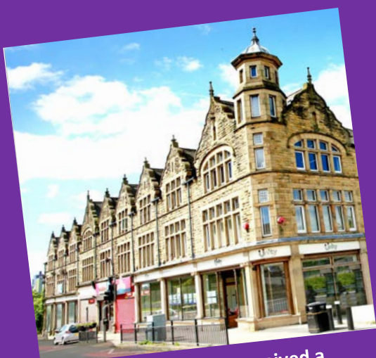
Our head office received a makeover in 2013