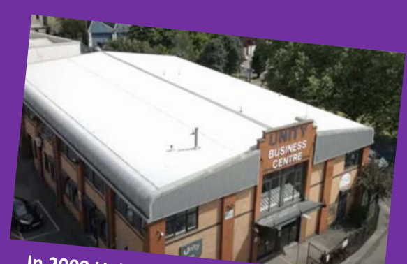
In 2000 Unity Enterprise forms offering local business support and accommodation